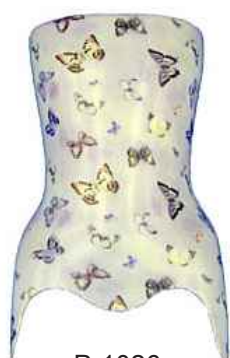
P-1026 LIGHT BUTTERFLY