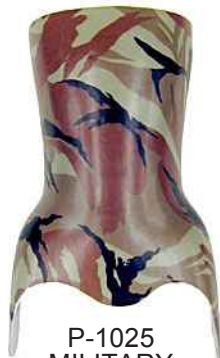
P-1025 MILITARY CAMOFLAUGE