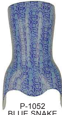
P-1052 BLUE SNAKE