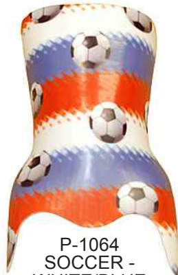
P-1064 SOCCER - WHITE/BLUE