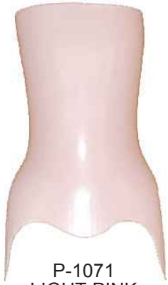
P-1071 LIGHT PINK