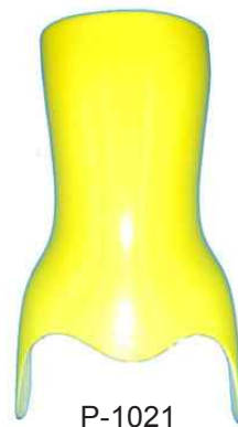
P-1021 UNI-GELB YELLOW