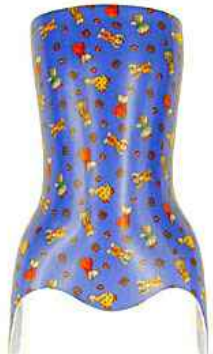
P-1004 LITTLE BEAR BLUE