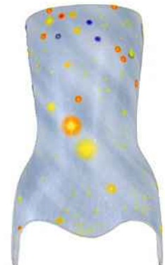
P-1032 LIGHT SKY