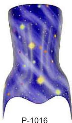
P-1016 DARK SKY