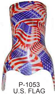
P-1053 U.S. FLAG