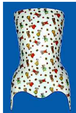
P-1045 LITTLE BEAR WHITE