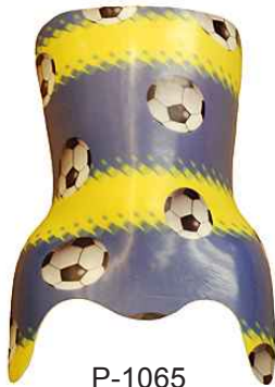
P-1065 SOCCER - BLUE/YELLOW