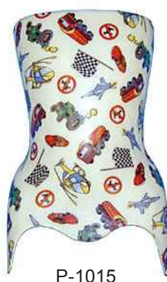
P-1015 FLY AND DRIVE WHITE