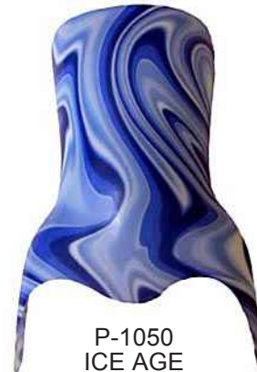
P-1050 ICE AGE