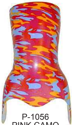
P-1056 PINK CAMO