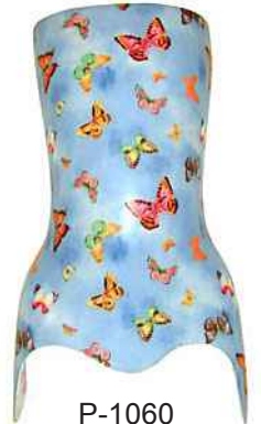
P-1060 SPRING BUTTERFLY