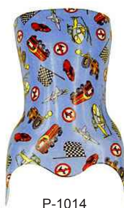
P-1014 FLY AND DRIVE BLUE