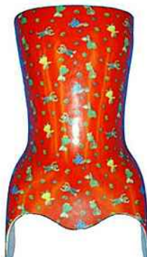
P-1003 LITTLE BEAR RED